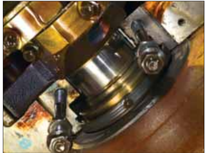
A closeup view of the rear main crankshaft journal. No visible wear detected.