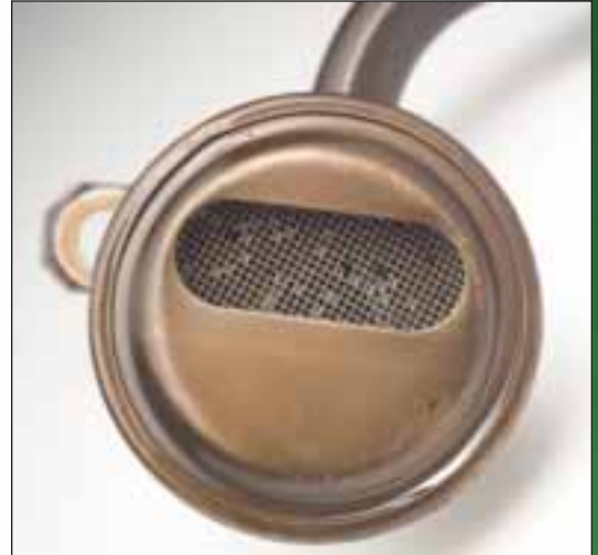
The oil pickup tube was very clean. There were minimal carbon deposits in the pickup tube screen..