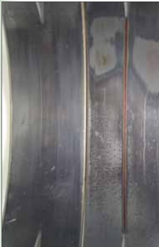
Engine main bearing halves show very little wear and are still suitable for continued use.

Each truck produces six quarts of waste-oil per oil change. With 60 vehicles being serviced every four months, that's 360 gallons per year. By switching to AMSOIL Guardian Pest Control prevents the disposal of 720 gallons of waste-oil every year. The environmental impact of this savings is enormous. It also frees up shop space that would be eaten up by drums of used oil.