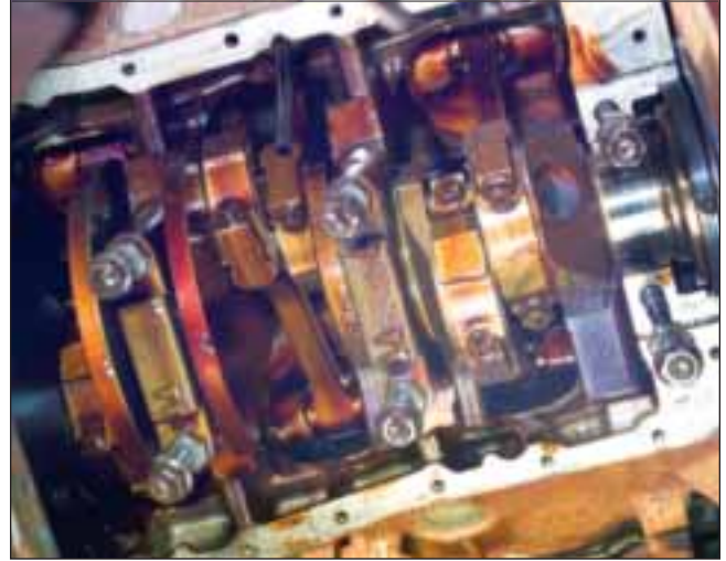
The lower crankcase area was very clean and free of any sludge deposits. The rear main bearing journal was removed showing no signs of visible wear on the crankshaft journal.