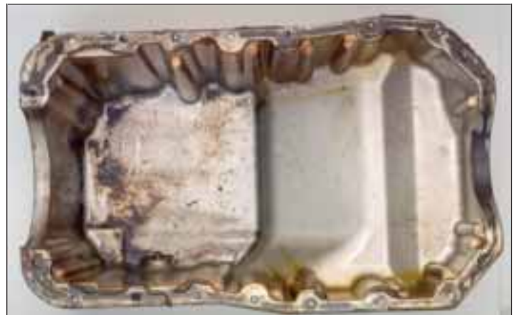
The inside of the engine oil pan was very clean. There were no sludge deposits found in the bottom of the pan.