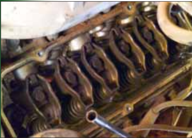
A wider view of the head and rockers. Very clean.